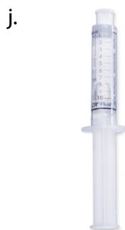
Sodium Chloride Syringe