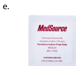
PVP Prep Pad