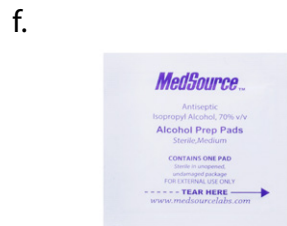
Alcohol Prep Pad