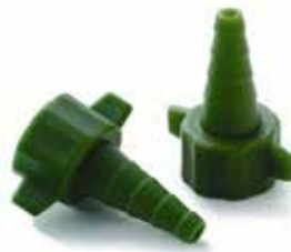
XMS Tree Adapter